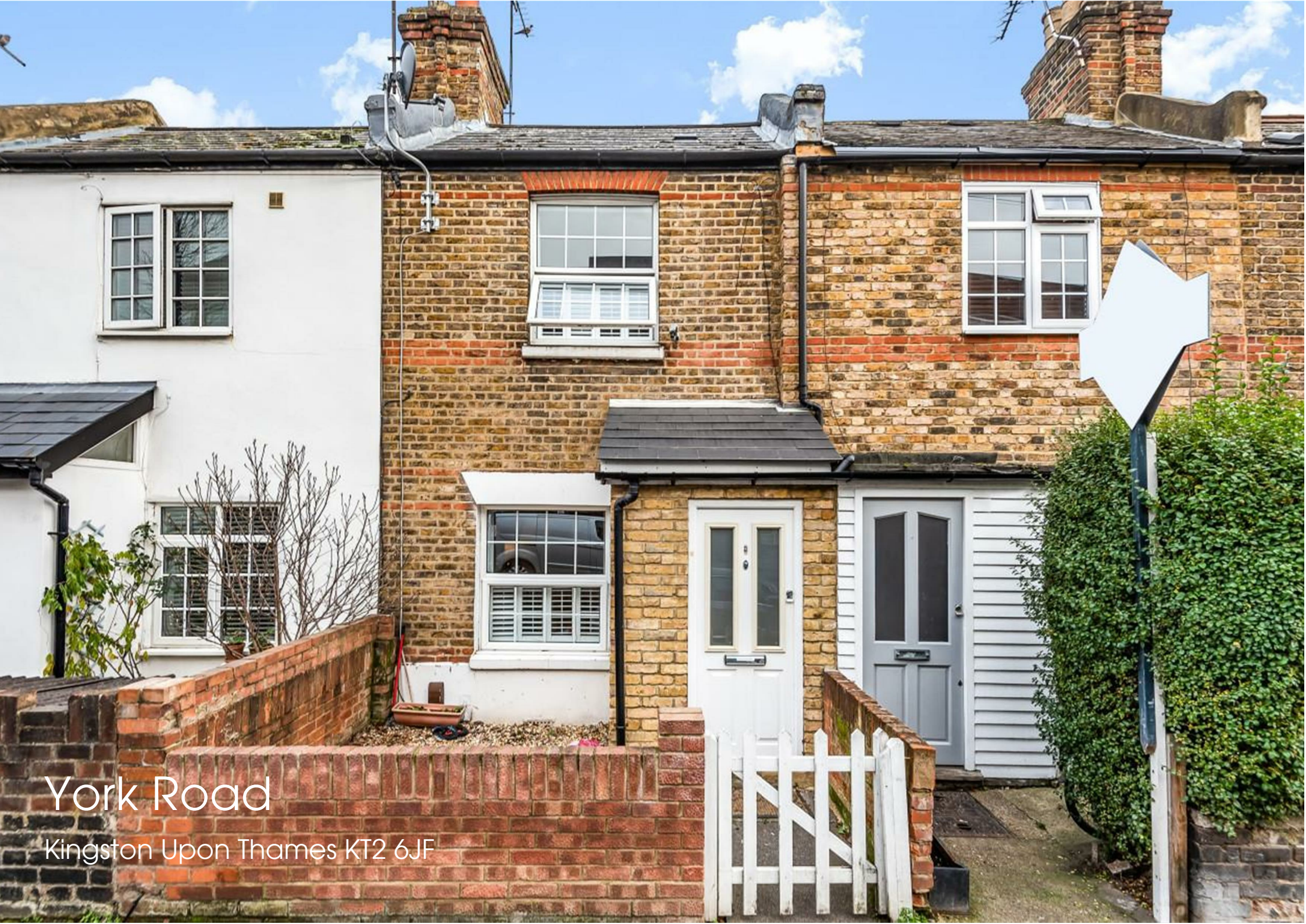
York Road Kingston Upon Thames KT2 6JF